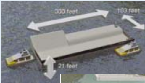
◀ Braddock Gated Dam Floatable section to be set in place on pier foundation

● Cast-in-place SLC interior supports and floor sections