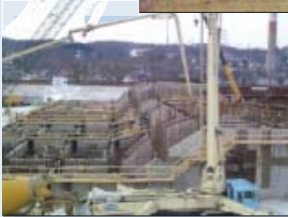
◀ Braddock Gated Dam Floatable section under construction (February 2001)