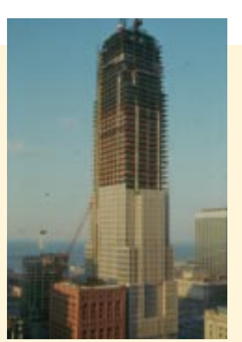
When construction of speculative office buildings slowed in the early 1990s, use of high-strength silica fume mixes dwindled as well.

1990 Phase I of Concrete Canada is launched, through 1994, with Phase II from 1994 through 1998. A consortium of research centers — the Network of Centres of Excellence on High-Performance Concrete — encompasses 12 research projects, six bridges in Ontario and Quebec, and a number of repair projects incorporating silica fume